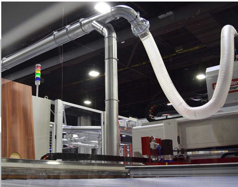
Above: A QF Ball Joint is shown in a QF duct line installed on woodworking machinery. Nordfab provides a full range of PU Hoses.