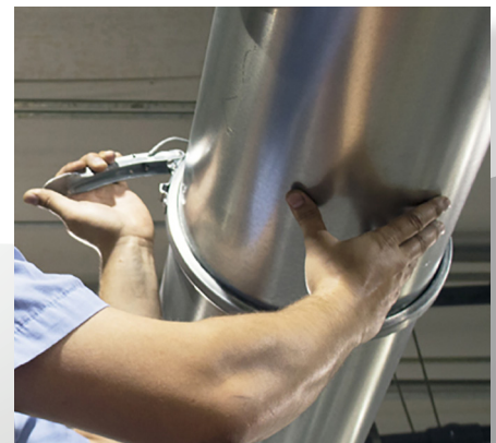
QF Duct is quickly and easily clipped together.